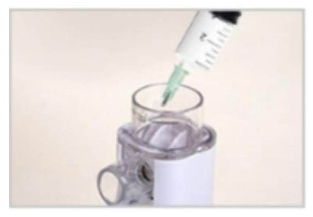
2. Fill the medication (10ml Maximum)