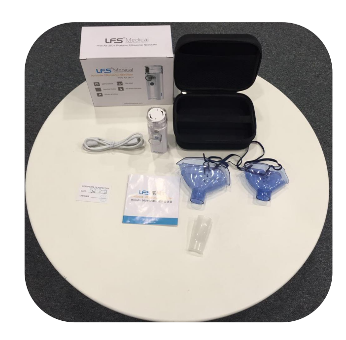
mini Air 360 + Mesh Nebulizer