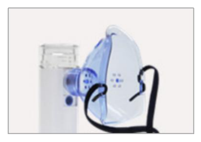
3. Connect the mouthpiece or mask