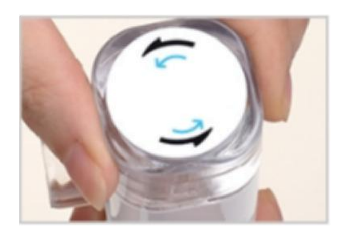
1. Remove the medication bottle cover